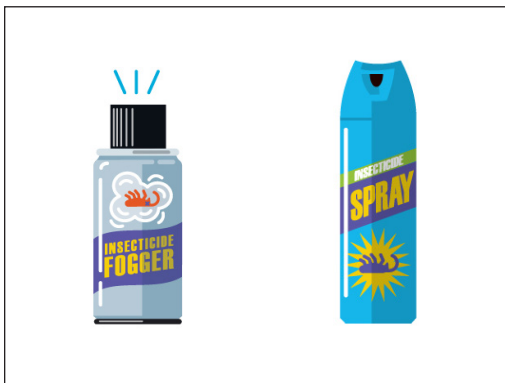
Foggers and sprays are regulated under HSA.