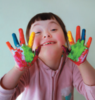
California Child Care Disaster Plan 2016 | 7