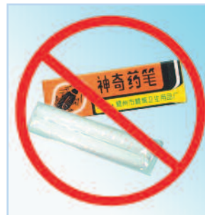
Illegal insecticide chalk.

Miraculous Chalk or Chinese Chalk, is usually imported from China and is not expensive. It looks like simple blackboard chalk.